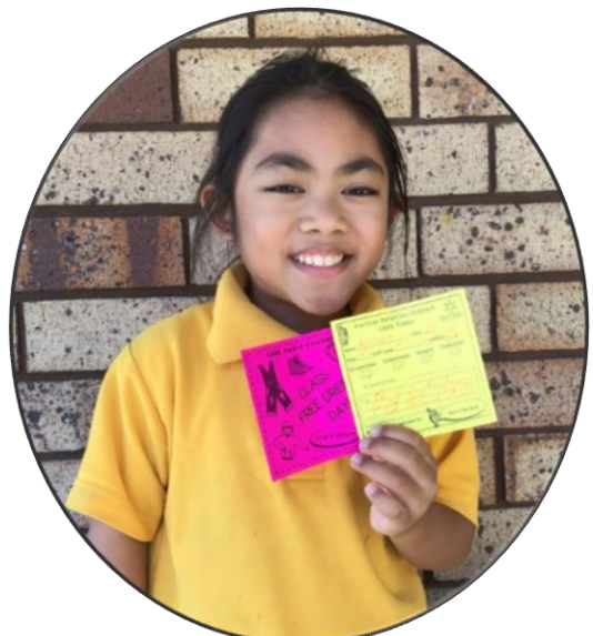
AALIYAH - D5