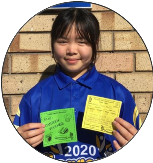
SHVEN - C2