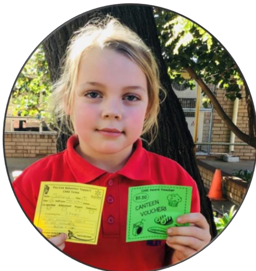
SIENNA - A1